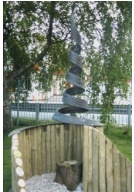
The Vortex Sculpture in our front garden at work

In November last year we unveiled our first ever made Vortex Sculpture in the front of our CIR building. It was a very pleasant occasion enjoyed by all who came.