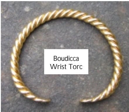
Boudicca Wrist Torc

Ancient Sources collection is inspired by the combination of reviving ancient art forms (that objectify traditional knowledge and wisdom) and the universal truth of water as a sacred life force.