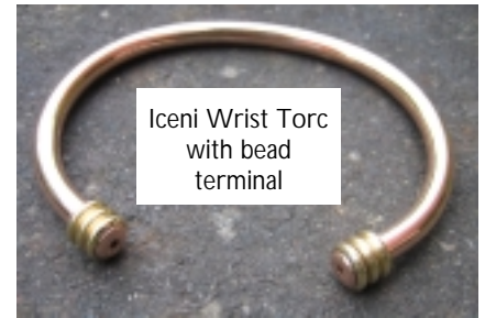
Icenii Wrist Torc with bead terminal

available with optional bead terminals (surcharge: £2.00-£2.35 incl. VAT), which are especially popular with men. They can be supplied with either brass or silver-plated beads, which have a striking 2-tone effect. Please indicate your preference on order form.