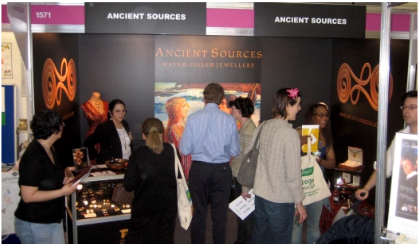
Our busy stall at the Natural and Organic Product Show, Olympia, London